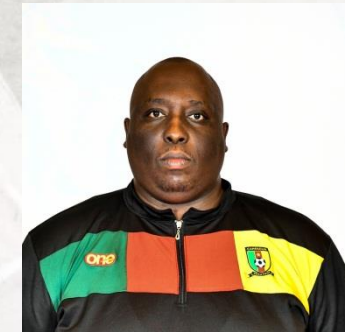
Simo Nogue Ulrich Photographer